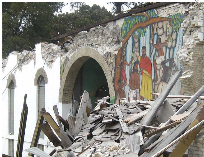
Bill Meub image

"Baptism of Our Lord," a fresco by painted by Castera Bazile, is all that remains of the many painted on the walls of the Episcopal Cathédral Sainte Trinité in Port-au-Prince by Haitian artists in 1950-51.