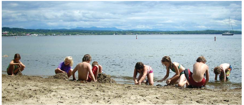
Campers enjoy the beach at Eagle Bay.