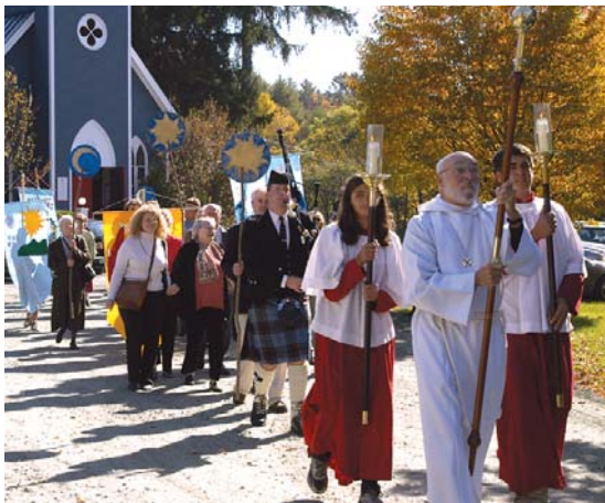
Members of St. Barnabas, Norwich, process to the dedication ceremony.