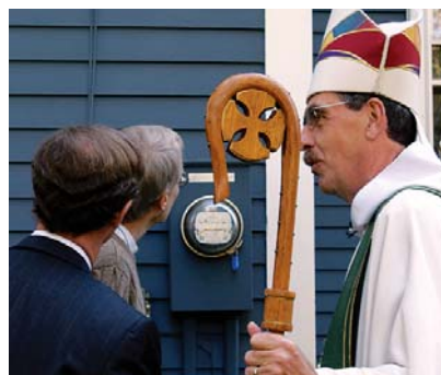
Watching the electric meter run backwards.

Hilgartner said she had wanted to see churches, many of which have large south-facing roofs, use solar power. As she considered the Flowers's offer, such a system seemed to be a wonderful and creative gift that would be good not just for St. Barnabas but also for the Norwich community. ❖