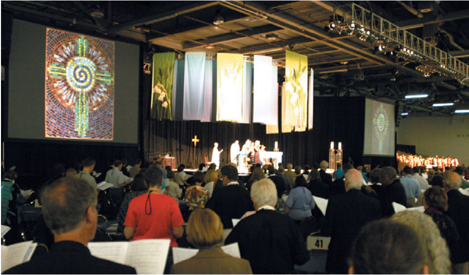
Above: The Convention worship space included two screens with changing displays of artwork organized by The Episcopal Church and the Visual Arts.