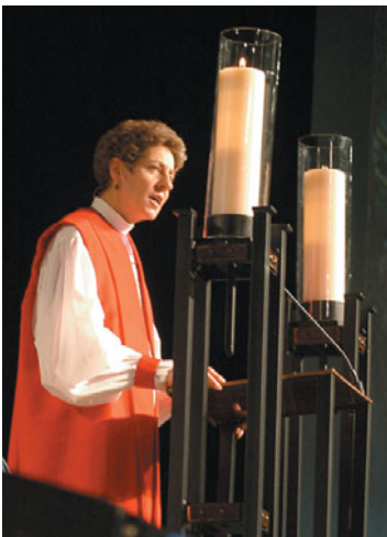
Above: Presiding Bishop-elect Katharine Jefferts Schori preaching at the closing Eucharist.