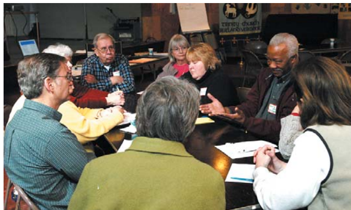
Wardens participate in a small group conversation at the workshop for wardens, vestry members and treasurers at Trinity, Rutland, on March 18.